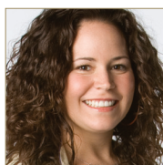
Chef Stephanie Izard

Then, the "Top Chef" Cook-Off Challenge between Bravo TV's last two champions! "Top Chef" 2008 winner, Stephanie Izard, defends her title in a cook-off against 2009 winner, Hosea Rosenberg.